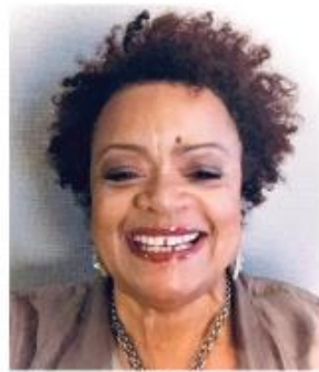
Renee Poignard Actress & Author